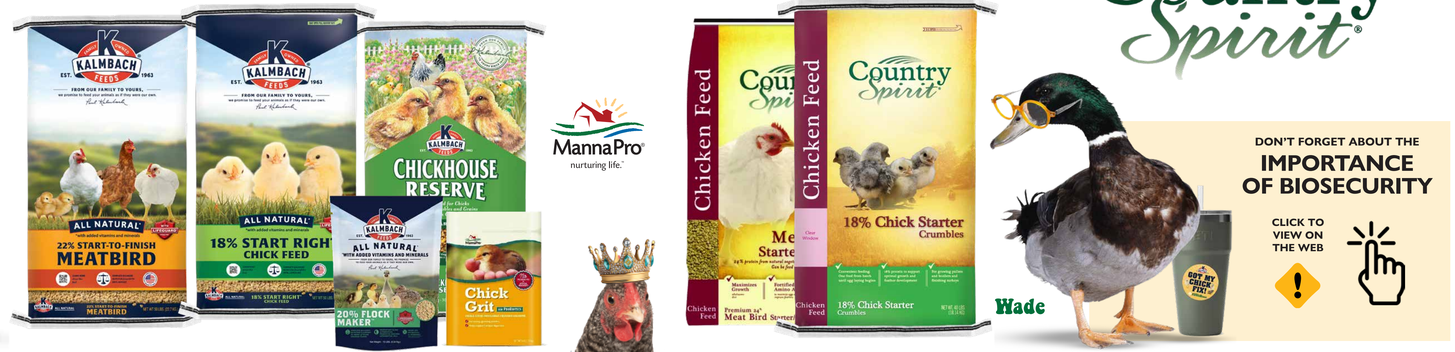
DeeDee & Dixie